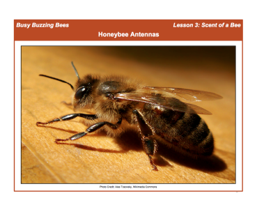
Honeybee Antennas photograph