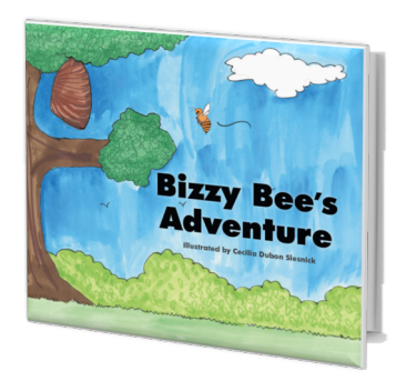
ECHOS Book: Bizzy Bee's Adventure