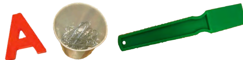
For each child