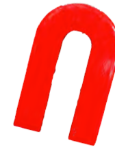
small strong horseshoe magnet