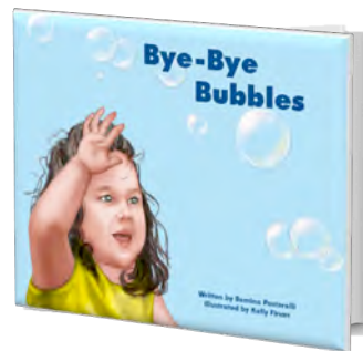
ECHOS Book: Bye-Bye Bubbles