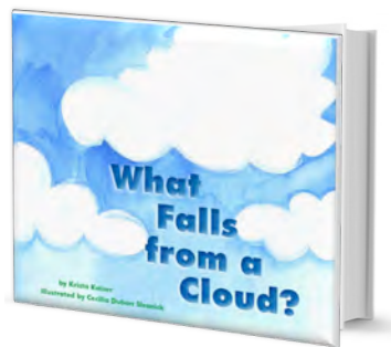
ECHOS Book: What Falls from a Cloud?