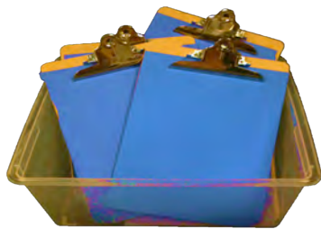
clipboards and chalk