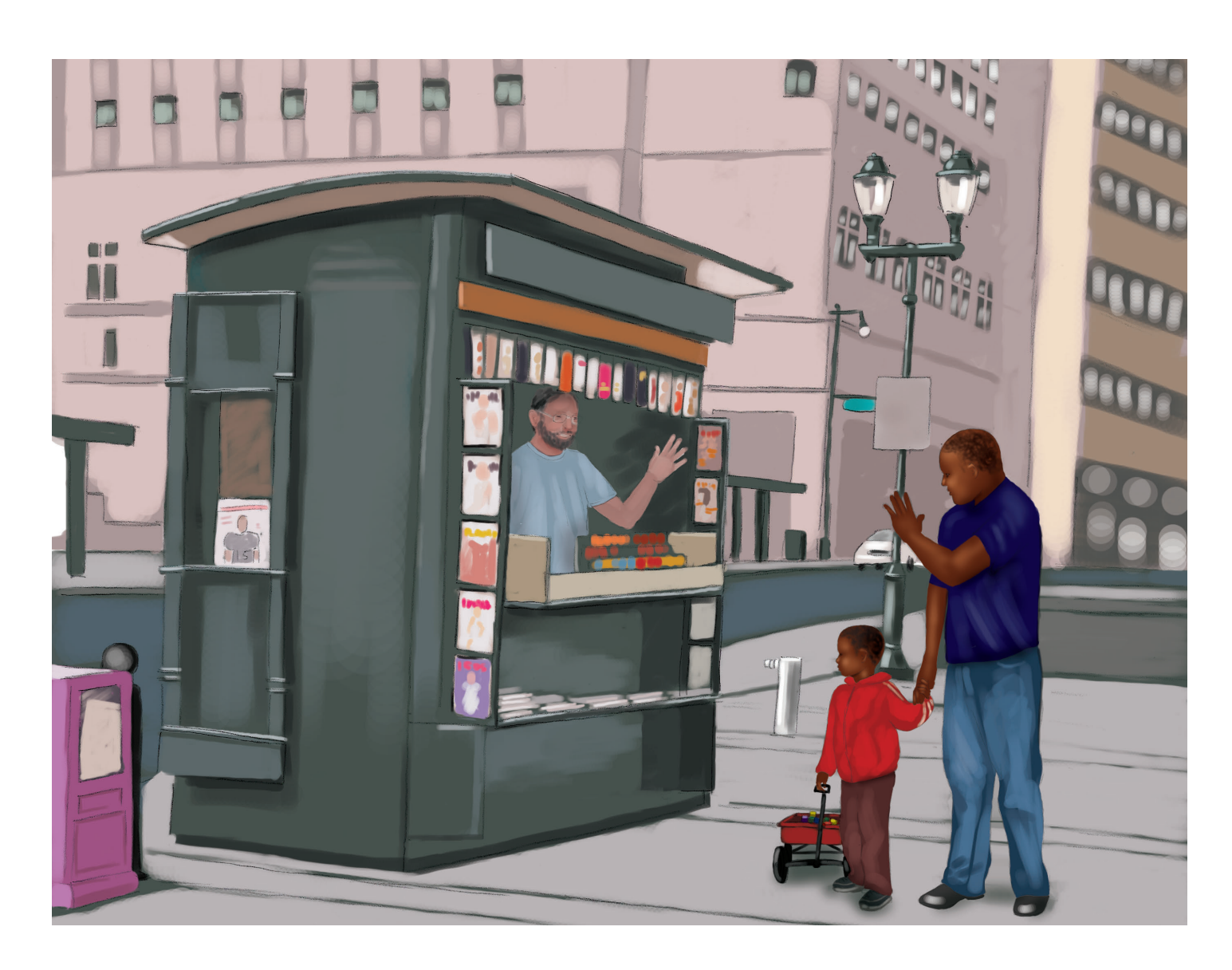
I never knew I could use my blocks to measure so many things. I wonder what we will measure next.