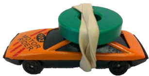
toy car with ring magnet