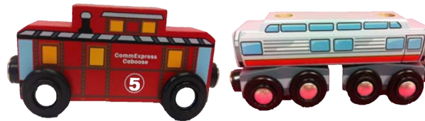
toy train cars