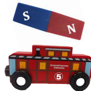
For each child